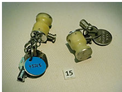
nuclear weapon keys