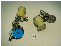
nuclear weapon keys