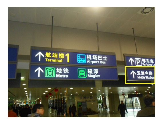
Figure 4: Middle Wuzhou Path.

Different from T1, International arrival of T2 is on the first floor. Go alone yellow line (Fig ??), get onto North Wuzhou Path (Fig ??), follow the overhead directions, you will reach the gate leading to Airport Bus stops (Fig ??, Fig ??). Please take Line No.1 (Fig ??).