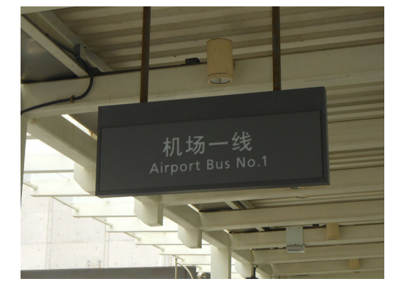
Figure 7: The gate leading to Airport Bus stops.