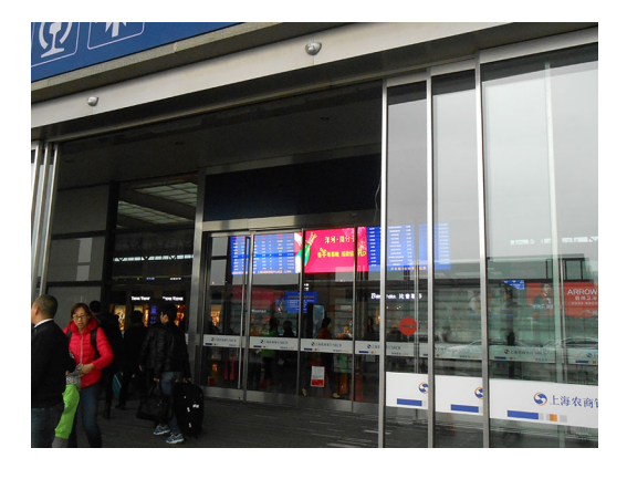
Figure 14: South Departure gate.

the lounge. There are several ticket offices inside the lounge where you can buy a ticket by showing passport (Fig ??). The formal destination is NanJingNan (南京南, Nanjing South Railway Station).