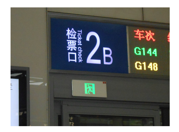
Figure 17: Boarding gate inside the lounge.