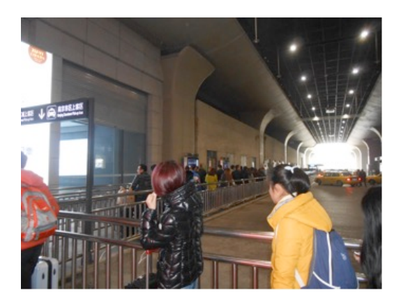
Figure 25: Get into the waiting lane for "Nanjing Downtown" (less than 20 minutes).