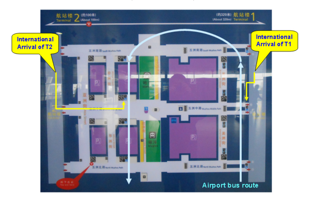
Figure 1: Plan of Shanghai Pudong International Airport.

The benefit of going through Shanghai Pudong International Airport (浦东机场, IATA: PVG) is that PVG is one major international airport of China which has more flight choices. PVG has two large terminals (T1 and T2) arranged as the verticals of a H shape. The crosspiece of the H is a walkway with moving sidewalks and transport connections such as airport bus, metro line and the fast Maglev trains (as shown in Fig ??).