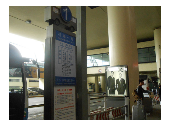
Figure 3: Airport Bus Line No. 1 at T1.

Different from T1, International arrival of T2 is on the first floor. Go alone yellow line (Fig ??), get onto North Wuzhou Path (Fig ??), follow the overhead directions, you will reach the gate leading to Airport Bus stops (Fig ??, Fig ??). Please take Line No.1 (Fig ??).