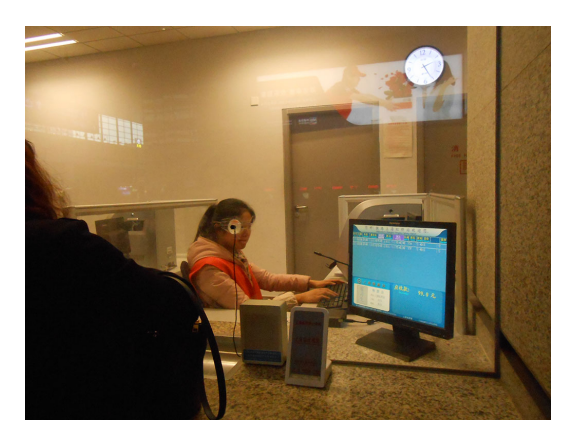
Figure 16: Ticket office inside the lounge.