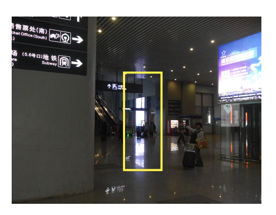
Figure 24: Follow the overhead directions for Taxi (East).