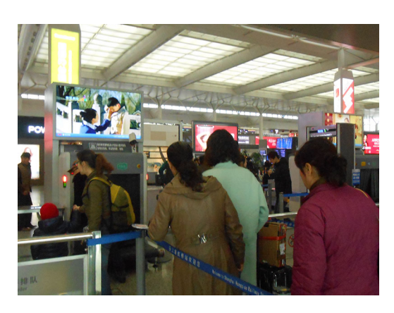
Figure 15: Security Checking.

Find out the train number and boarding gate on the ticket (Fig??). Boarding gates can be located easily because there are very clear signs on each of them (Fig??).