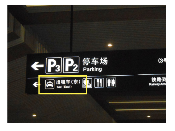
Figure 22: Follow the overhead directions for Taxi (East).