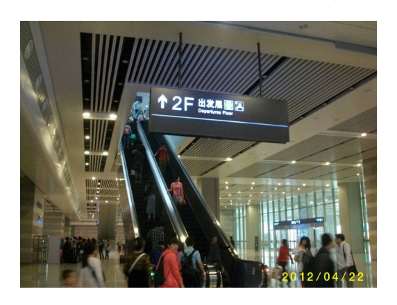
Figure 13: Escalator leading the departure floor.

the lounge. There are several ticket offices inside the lounge where you can buy a ticket by showing passport (Fig ??). The formal destination is NanJingNan (南京南, Nanjing South Railway Station).