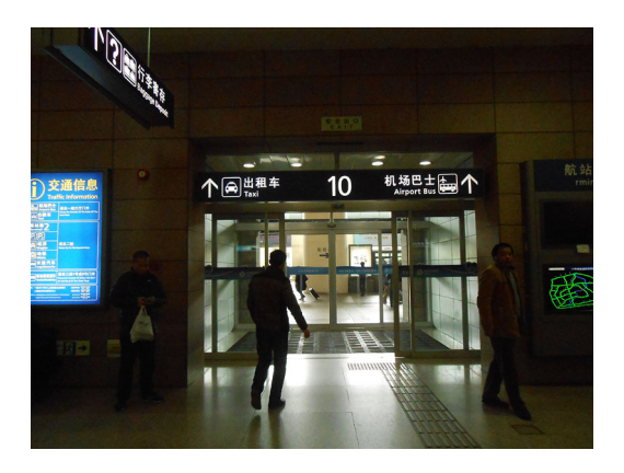
Figure 2: Exit gate 10 of T1.

Fig 1., going through exit gate 10 (Fig ??), you can get to airport bus stops. Please take Airport Bus Line No.1 (Fig ??).