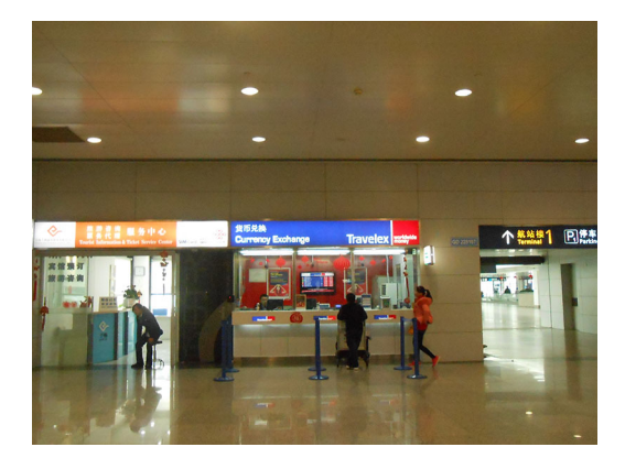
Figure 9: Currency change.