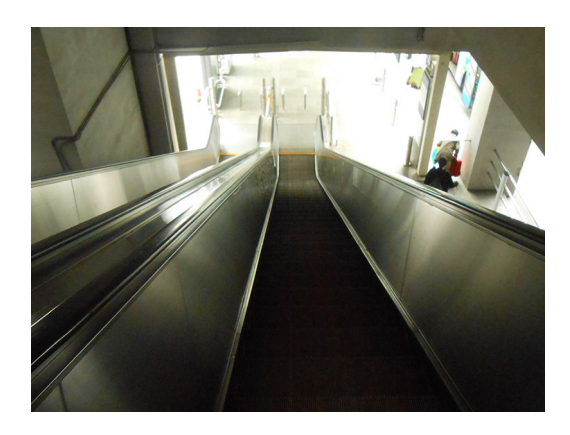
Figure 6: Escalator behind the door.