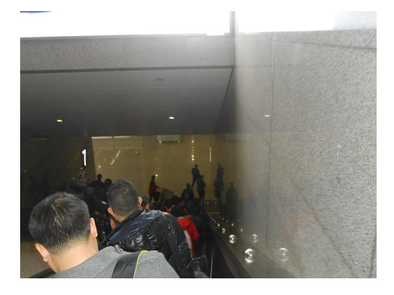
Figure 20: Go downstairs via escalator.