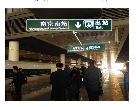
Figure 19: Get off the train and go to the exit.

The following figures show how to get to the taxi stop by following overhead directions.