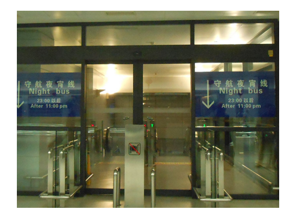
Figure 5: The gate leading to Airport Bus stops.