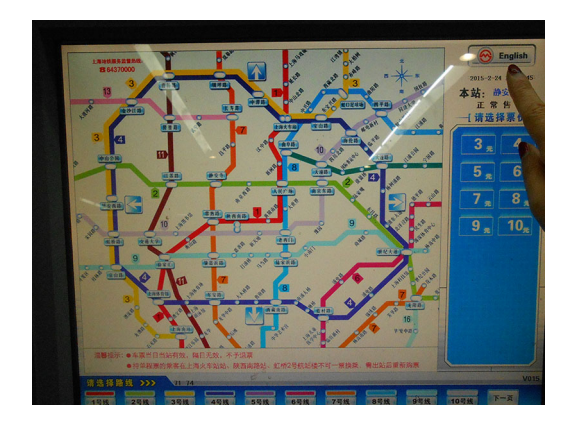
Figure 8: Metro ticket vending machine.