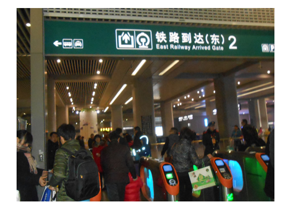
Figure 21: Go through the ticket check.