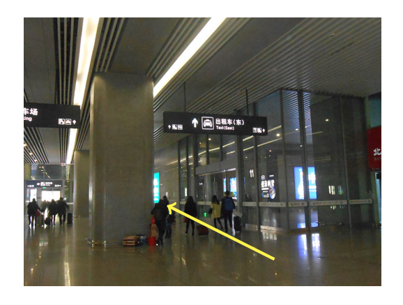
Figure 23: Go through the ticket check.