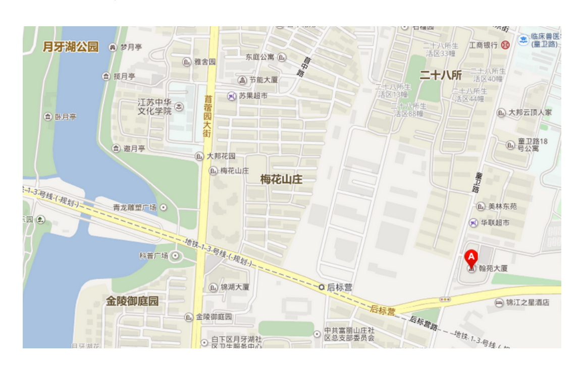
Figure 2.1: The location of the Hanyuan Hotel. Please print out!