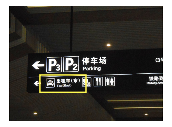
Figure 22: Follow the overhead directions for Taxi (East).