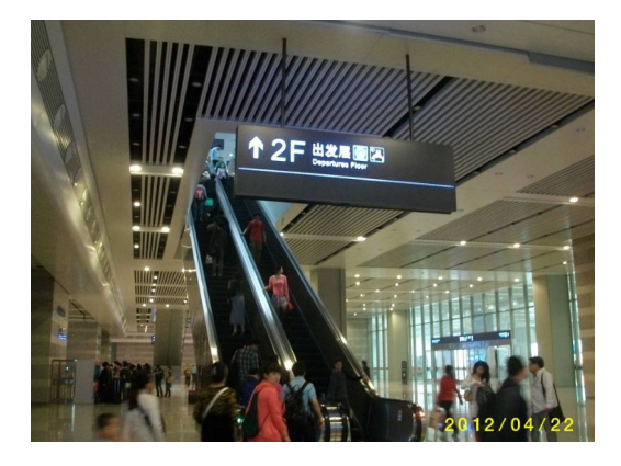
Figure 13: Escalator leading the departure floor.

lounge. There are several ticket offices inside the lounge where you can buy a ticket by showing passport (Fig 16). The formal destination is NanJingNan (南京南, Nanjing South Railway Station).