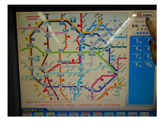
Figure 8: Metro ticket vending machine.