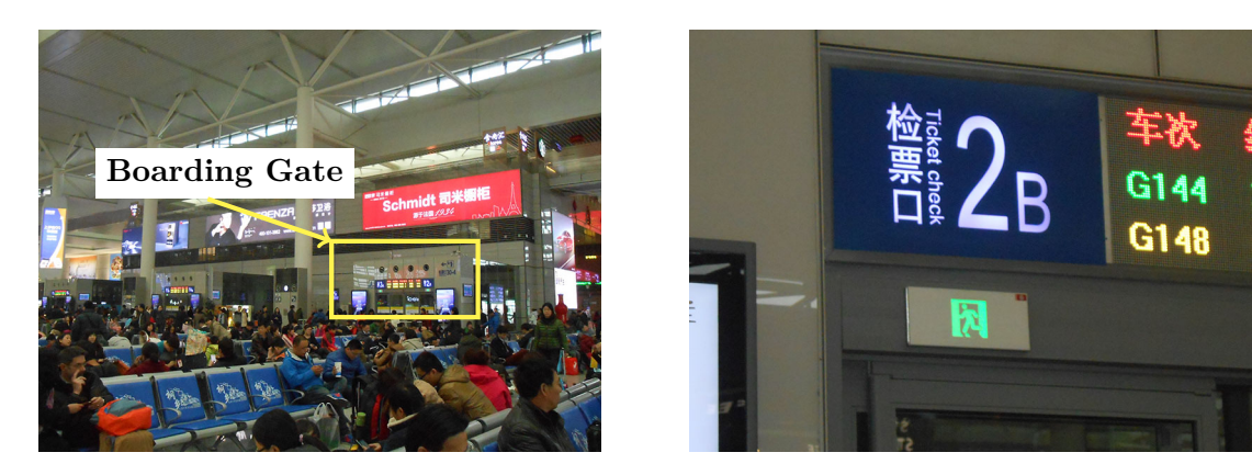
Figure 17: Boarding gate inside the lounge.