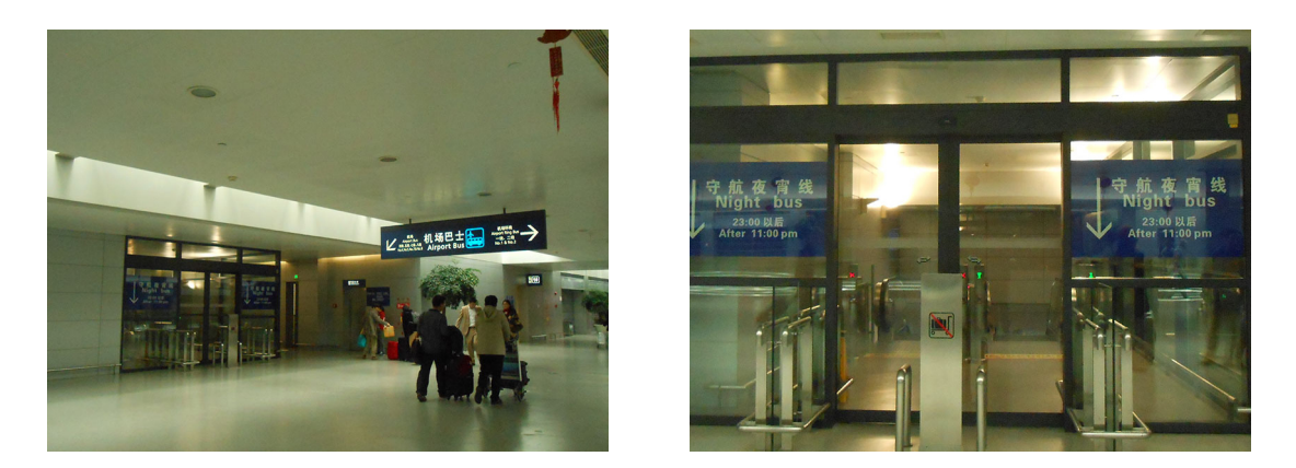
Figure 5: The gate leading to Airport Bus stops.