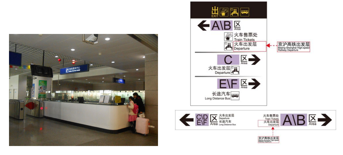
Figure 10: Metro service center.