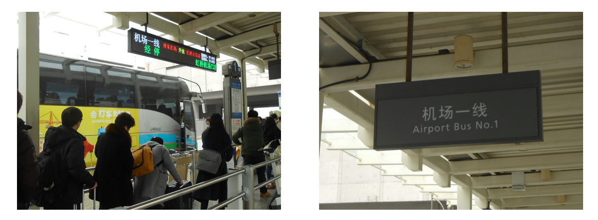
Figure 7: The gate leading to Airport Bus stops.