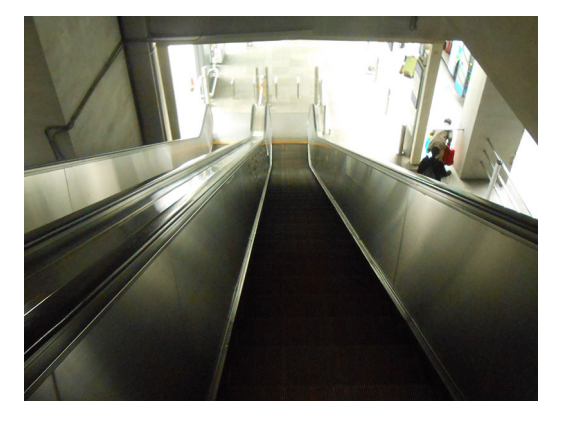
Figure 6: Escalator behind the door.