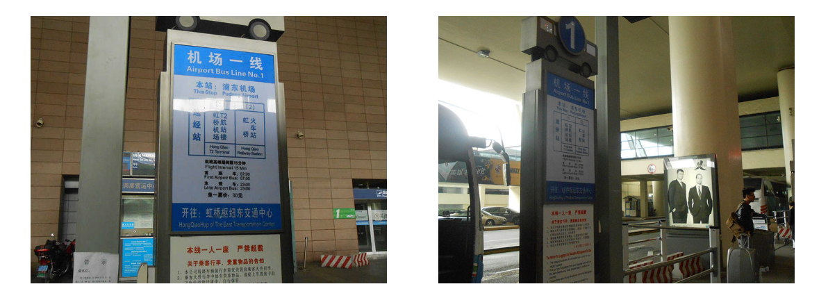
Figure 3: Airport Bus Line No. 1 at T1.

Different from T1, International arrival of T2 is on the first floor. Go alone yellow line (Fig 1), get onto North Wuzhou Path (Fig 4), follow the overhead directions, you will reach the gate leading to Airport Bus stops (Fig 5, Fig 6). Please take Line No.1 (Fig 7).