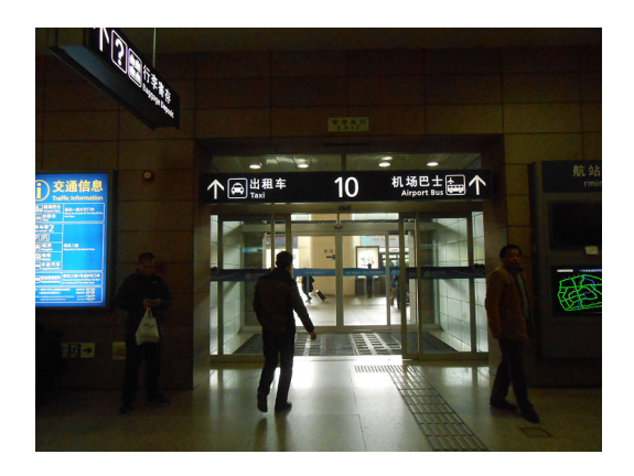
Figure 2: Exit gate 10 of T1.

1., going through exit gate 10 (Fig 2), you can get to airport bus stops. Please take Airport Bus Line No.1 (Fig 3).