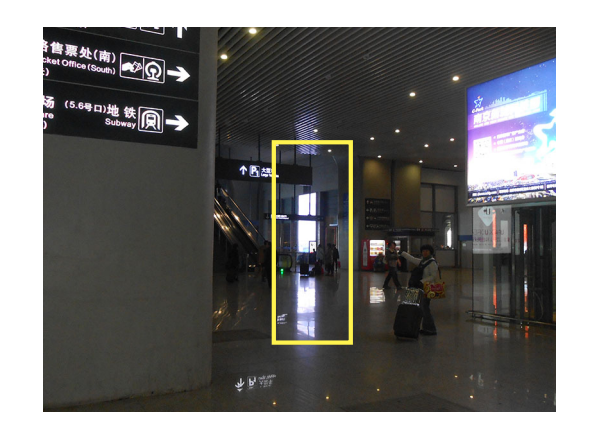
Figure 24: Follow the overhead directions for Taxi (East).