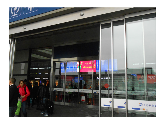
Figure 14: South Departure gate.

lounge. There are several ticket offices inside the lounge where you can buy a ticket by showing passport (Fig 16). The formal destination is NanJingNan (南京南, Nanjing South Railway Station).