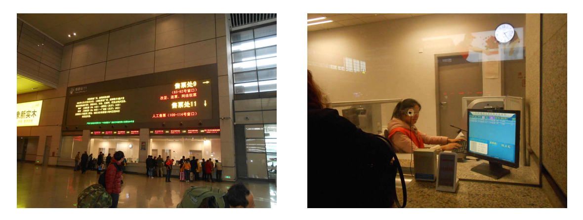
Figure 16: Ticket office inside the lounge.