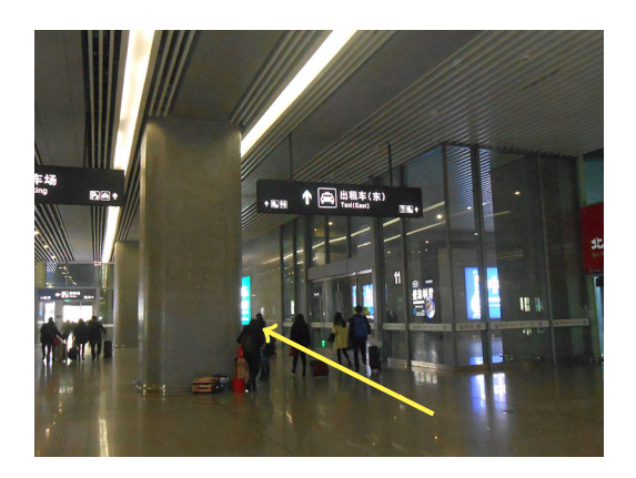
Figure 23: Go through the ticket check.