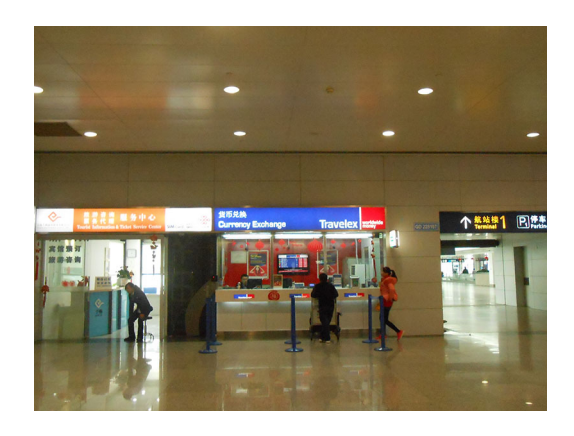
Figure 9: Currency change.