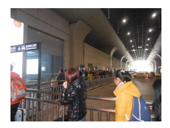
Figure 25: Get into the waiting lane for "Nanjing Downtown" (less than 20 minutes).