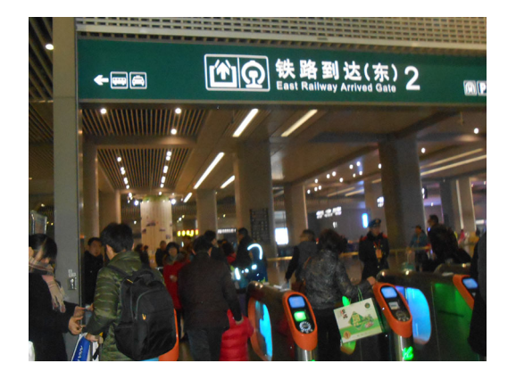
Figure 21: Go through the ticket check.