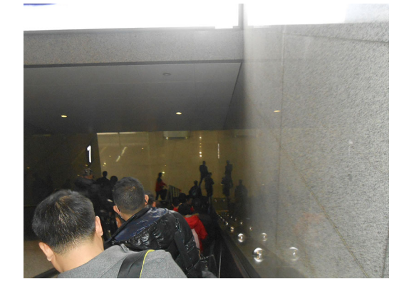
Figure 19: Get off the train and go to the exit.