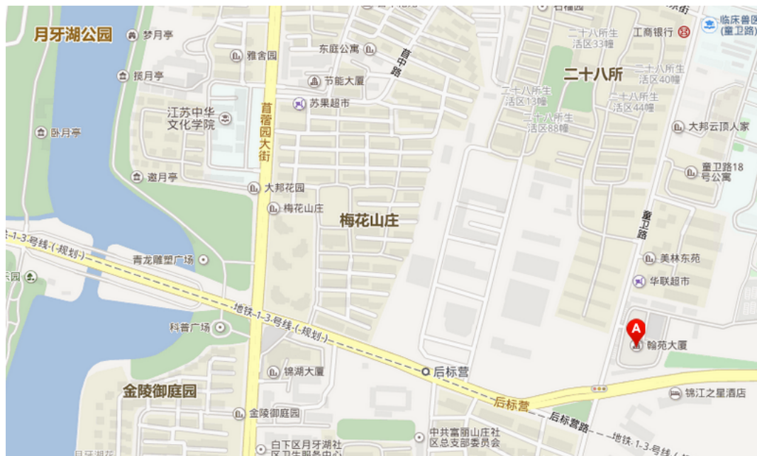
Figure 2.1: The location of the Hanyuan Hotel. Please print out!

司机师傅，请将我送到“童卫路 20 号翰苑宾馆”，其位置如地图中红色 A 点所示。 酒店电话：02584393962。谢谢！