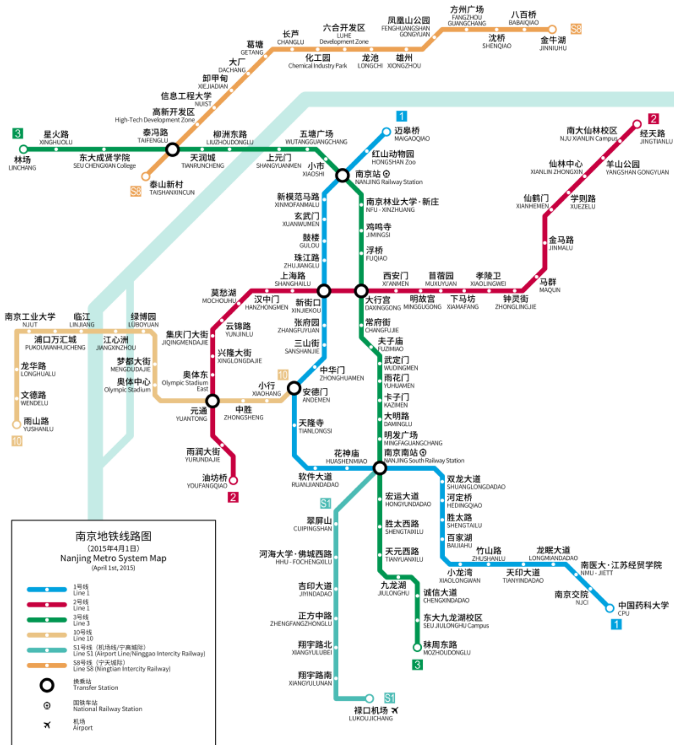
Figure 2.2: Metro map of Nanjing. Stations Xiamafang and Muxuyuan on Line 2 are closest to the hotel.