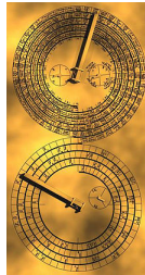
Antikythera automaton, 100 BC (Archimedes?)

Email: christian.urban at kcl.ac.uk Office: S1.27 (1st floor Strand Building) Slides: KEATS